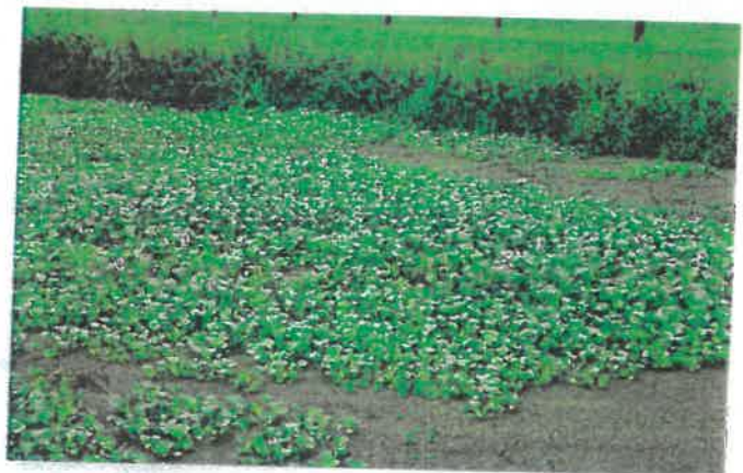
Waterway choked with weed