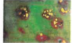
10. Myrtle rust